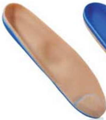
SureFit Custom Tri-Laminate Insert composed of cork shell, polyurethane layer and flesh-tone Plastazote top cover with hallux toe filler and Charcot relief.