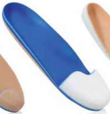
SureFit Custom Tri-Laminate Insert with cork shell, polyurethane layer, blue EVA top cover and transmetatarsal toe filler.