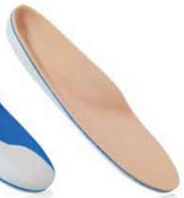
SureFit Custom Tri-Laminate Insert composed of EVA shell, polyurethane layer and flesh-tone Plastazote top cover.