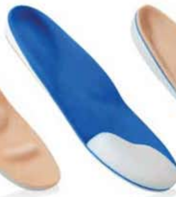
SureFit Custom Bi-Laminate Insert with blue Plastazote top cover, white EVA shell, cork lateral wedge and multi-digit toe filler.