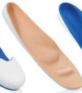
SureFit Custom Bi-Laminate Insert with Crest Pad and Met Bar; flesh-tone Plastazote top cover.