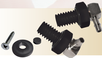
Aria™ Safety Barb