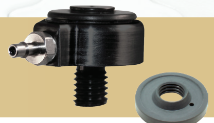
Aria™ Hybrid Valve

For Use with the Vista Ankle or any Other Elevated Vacuum System