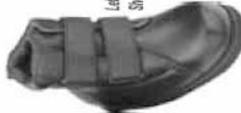
Left 503-C Shown