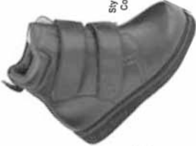
Style No. 503 Color: Black